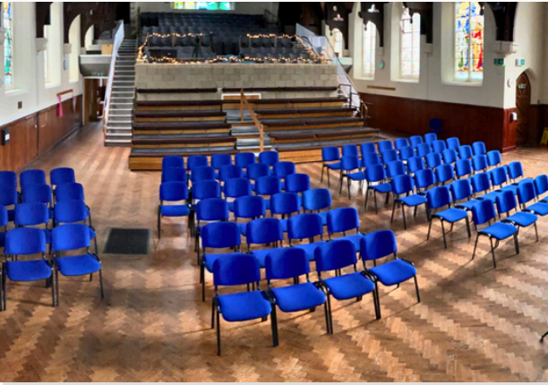
Large adaptable space