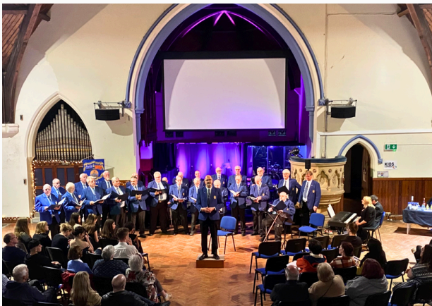
Ideal concert venue