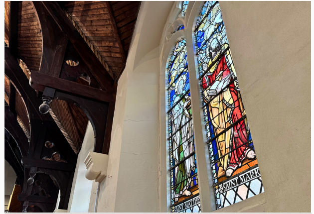
19th Century features