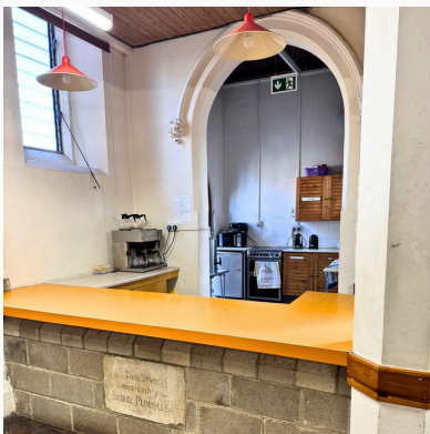
Kitchen with serving counter

Our front hall community space is a spacious room that can be used for multiple purposes, ideally located at the front of The Cornerstone Centre. The front hall has access to toilet facilities and the main hall, making it an ideal reception space for your concert or event. The kitchen can be hired for an additional one off fee of £10.