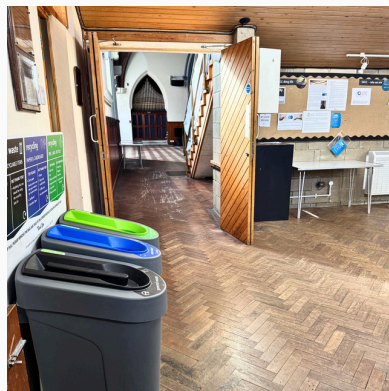
Easy access to Main Hall